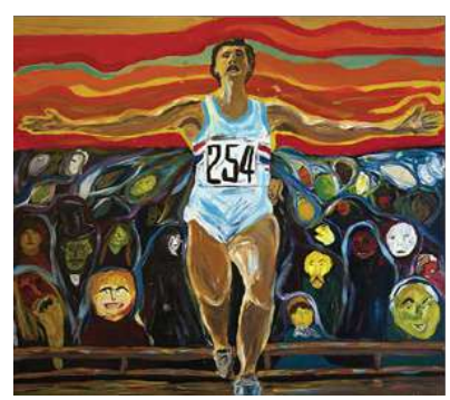
Figure 2. Examples of the Year 9 'Legacy Gallery'

Art has perhaps unsurprisingly provided the most visually stimulating example of subject-specific enrichment. This involved a Year 9 project in which students identified iconic moments from Olympic or Paralympic history which they then interpreted in a particular genre, following further research into both the event and techniques of their chosen artist and style. This has given rise to an impressive 'Legacy Gallery' of more than twenty 1m x 1m framed works, displayed across the school site and also turned into greeting cards which are used when writing to students or staff to commend them for outstanding work. In both respects, this reinforces the cultural focus on historical sporting achievement and the associated Olympic and Paralympic Values. Figure 2. below provides two examples from the Gallery: a Munchinspired interpretation of Sebastian Coe's 1980 Moscow 1500m Gold winning 'Scream' and a Hokusai Ben Ainslie, appropriately celebrating his victory in the 2008 Finn Class victory in Beijing on the crest of a stylised Hokusai 'Wave'. Figure 3. shows examples of the greetings cards.