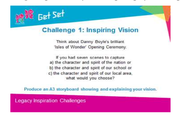
Figure 6. 2012 Opening Ceremony Challenge Legacy Challenge

History, Drama, Music and Art collaborated to support a thematic 'Legacy Challenge' competition, open to students in every year group and based on Danny Boyle's Isle of Wonder London 2012 Opening Ceremony. The nature of the challenge activity is summarised in Figure 6 . below: