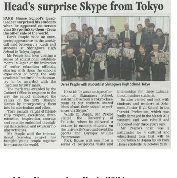
Figure 15. Visit to Japan, May 2018

where I additionally guest lectured on the Olympic and Paralympic Education Module of International Academy (TIAS) Masters Programme <sup>26</sup> (Figure 15.). Visiting Shinagawa High School and other schools in the Ibaraki Prefecture alongside staff from the University and members of the TOCOG<sup>27</sup> Education Team offered an excellent opportunity to reinforce the links between the academic study of sport and its associated values, the specific learning opportunities associated with hosting an Olympic and Paralympic Games and practical questions around curriculum planning and delivery at an operational school level. The latter were particularly relevant in the context of what remains a largely subject-content driven curriculum model where the adoption of more thematic and cross-curricular approaches to learning might prove both potentially challenging and unfamiliar.