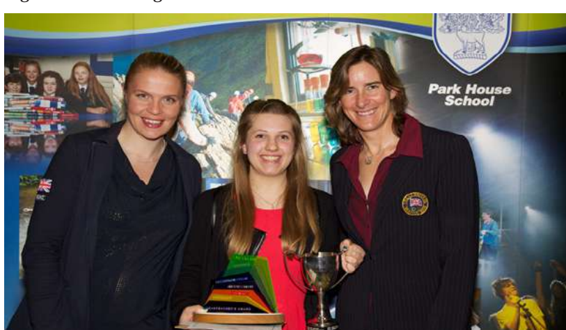
Figure 11. A 'Living the Values' Awards Presentation

equality-this ensures that a much wider range of students beyond those 'traditionally' lauded for their attainment receive deserved recognition and reward for their contribution to the school and community. This builds towards an annual presentation to students who consistently demonstrate a rounded commitment to all aspects of school life and a positive contribution to the wider community ( Figure 11. below). In essence, this is the school's recognition of young people who exemplify the spirit of Olympism, as expressed in the 2017 version of the Olympic Charter as follows: