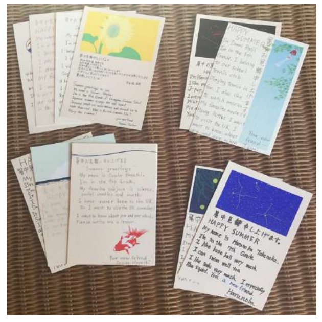
Figure 14. Shochu Mimai received as part of the Shinagawa Park House Values-themed Partnership

I was personally able to strengthen this relationship during a visit to Tokyo in May 2018 supported by the University of Tsukuba,