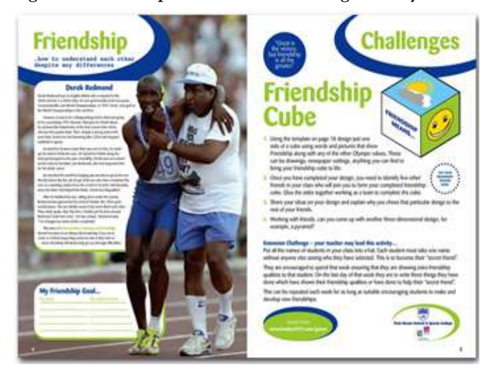
Figure 8. An example of a Values Challenge activity

The assembly programme<sup>16</sup> in turn amplifies learning about the Values by exploring an identified theme in the context of key moments or individuals from Olympic or Paralympic history. The weekly thirty-minute assembly for each year group is then followed up by a further forty minute discussion session in tutor groups, facilitated by the form tutor and supported by stimulus materials illustrated in Figure 9 . below.