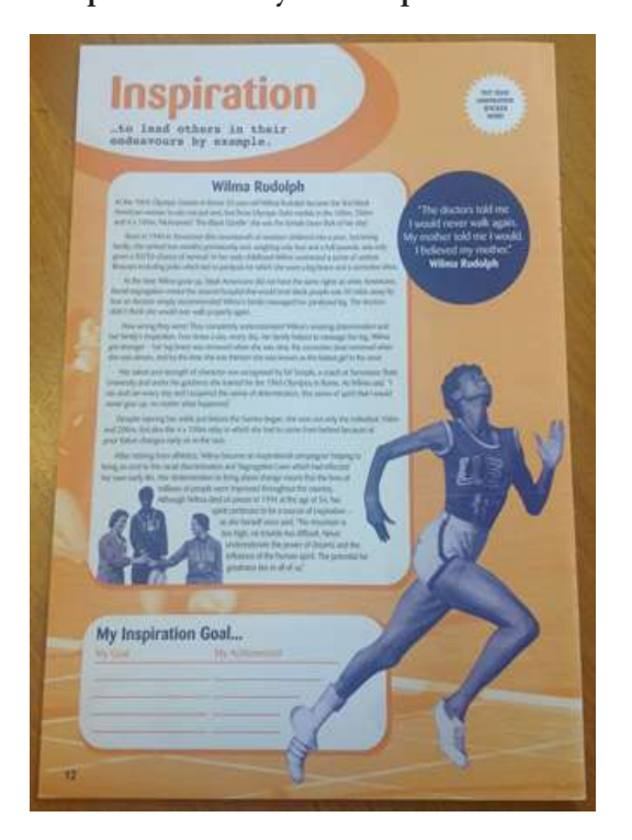
Figure 9. An example of Assembly follow-up materials

16 Each year group of c.200 students has a weekly assembly of 30 minutes led by myself as Headteacher or another senior member of staff. Students are also expected to prepare and lead their own assemblies as part of this programme.