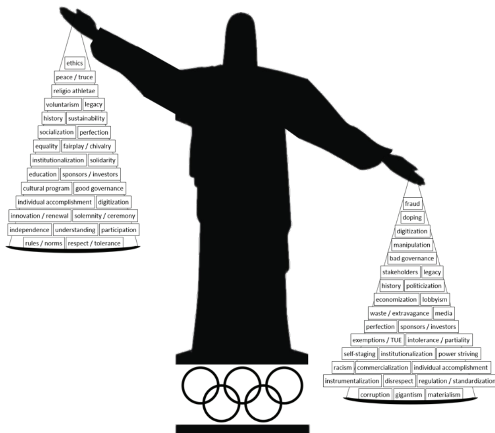
Figure 2. Current Olympic imbalance of opportunities and threats for today's modern Olympic Games, Olympic Movement, and Olympic idea. TUE = Therapeutic Use Exemption(s).

be discussed here, but the analysis gives an impressive overview of the most important subjects and background topics of OG and how they were seen, thus presented, by the newspapers. However, some weaknesses of the study must be mentioned. Especially, in the sections newspaper assessments on themes, statements, and authors sometimes low case numbers have impeded an unambiguous interpretation, and thus, can only be regarded as tendencies. In spite of all objectivity by the coder and the internal validity of the category system, subjective influences, in the classification process of contributions based on the grid, and slightly overlapping categories, are unavoidable. As a possible solution, to reduce the problem of intern reliability, the use of multiple encoders and the performance of an inter-coder reliability test, is recommended. In addition, to reduce the problem of intern validity, the adequate reduction of some categories seems appropriate.