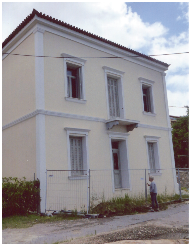
Figure 2. Second house of Kostos Tsiklitis' father (purchased after Kostos passed away).

In 1919, not long before his death, he exchanged it for a smaller house, which had previously been owned by the Greek national bank, of whom he was a creditor. This house stood on a rise above the harbour and had until then been the seat of the bank. After the exchange the bank moved into the larger house that had belonged to the father of the Olympic champion and was the birthplace of the latter; the first floor served as the bank manager's official residence. Around half a century later the national bank moved into a house directly beside Pylos's Plateia (main square) and left Tsiklitis's former house to fall into disrepair. 7 The "Old Bank" house also eventually fell into a ruin, until it was fairly recently restored by private initiative. So the old site for the victor's statue in front of this house was also connected to the Olympic champion's family history, though the ideal site would of course have been the house of his birth.