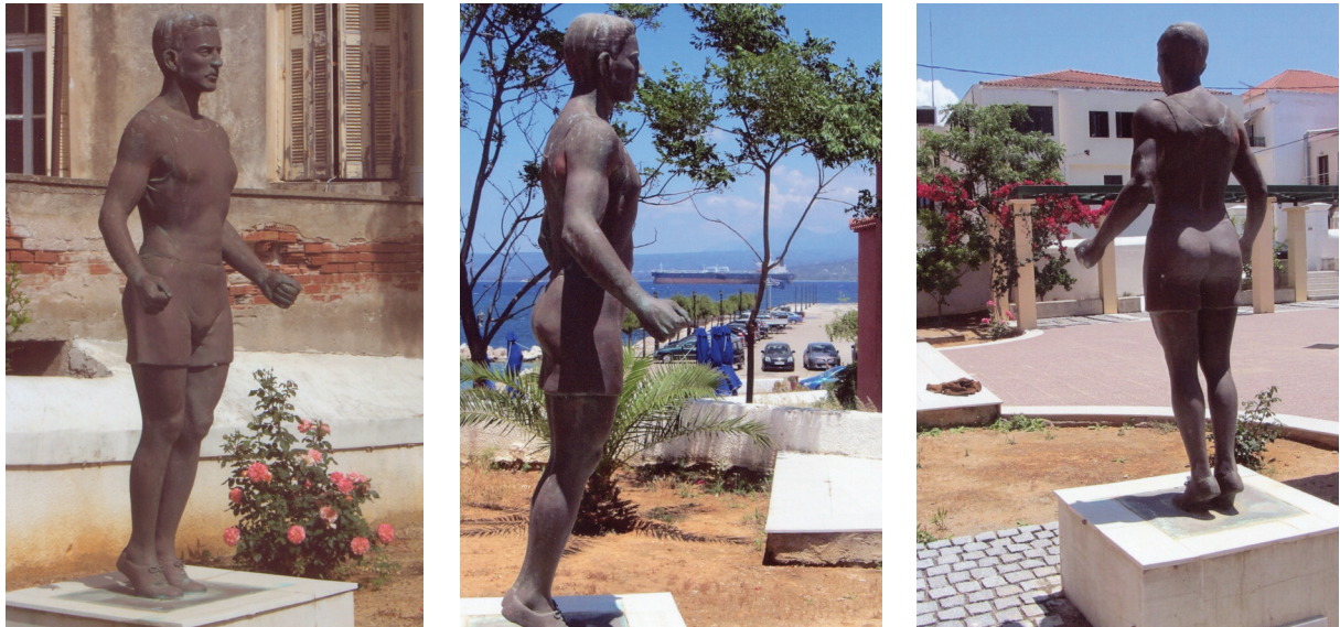
Figures 6, 7 and 8. Victory statue of Kostis Tsiklitis, new location in the garden of the house where the Olympic victor was born.

It also received a new plinth at this point that was significantly lower than the one that had stood in front of the smaller house that his father had swapped for the birth house.