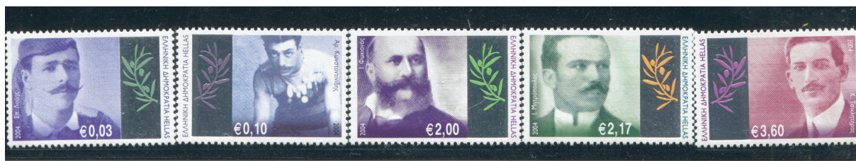
Figure 11. Stamp in honour of Kostis Tsiklitis, edited in 2004