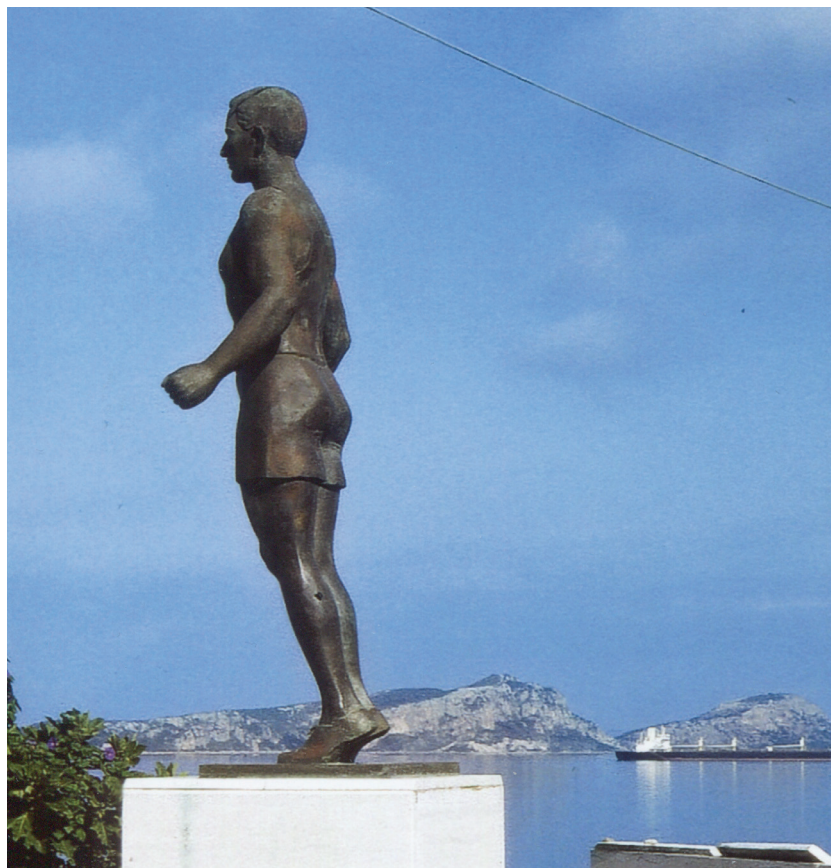
Figure 5. Victory statue of Kostis Tsiklitis, old location.

of the respective athlete. 26 There are very few originals remaining since over the centuries their metal was usually reused for other purposes (weapons, machinery, coins).